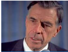
John Kenneth Galbraith

“The function of economic forecasting is to make astrology look respectable.”